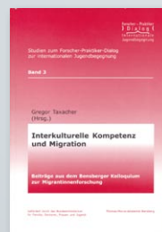
Gregor Taxacher (Hrsg.) Interkulturelle Kompetenz und Migration (Intercultural competences and migration)