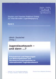
Ulrich Zeuschel (Hrsg.) Jugendaustausch – und dann ...? (Youth exchange – and then...?)